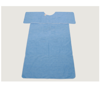
2. Open and unfold BARRIER EasyWarm+ completely and do not fold it over itself. When the blanket is exposed to air it reaches operational temperature within 30 min., which is maintained for up to 10 hours.