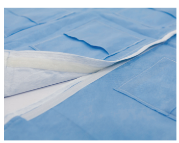
8. The blanket's upper and lower parts can easily be detached and reattached via the velcro. (The lower part can be split into two additional parts by cutting it on the indicated line.) This enables the blanket to suit different surgical patient positions.