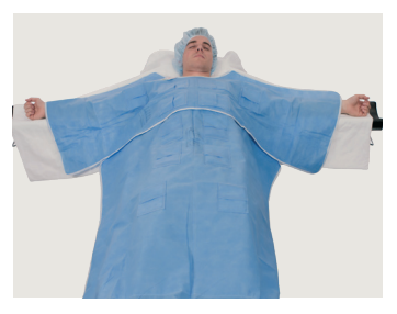
4. During the pre- and post operative period, and during surgical interventions on hands, arms and head, place BARRIER EasyWarm+ over the entire body.