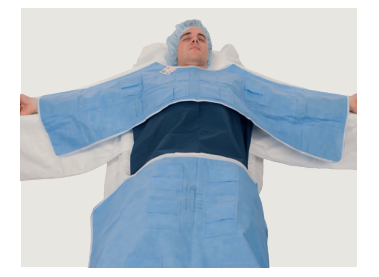
7. For surgical interventions in the abdominal area split BARRIER EasyWarm+ and place the upper part over extremities and chest and place the lower part over the legs and hips.